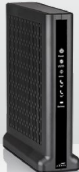
32100553 Touchstone TM3402B/CE eMTA