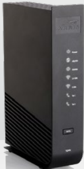
32804008 Cable Modem TG2492S-CE-85