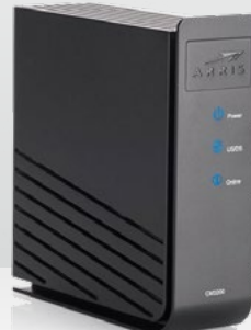
32100614 Cable Modem CM3200